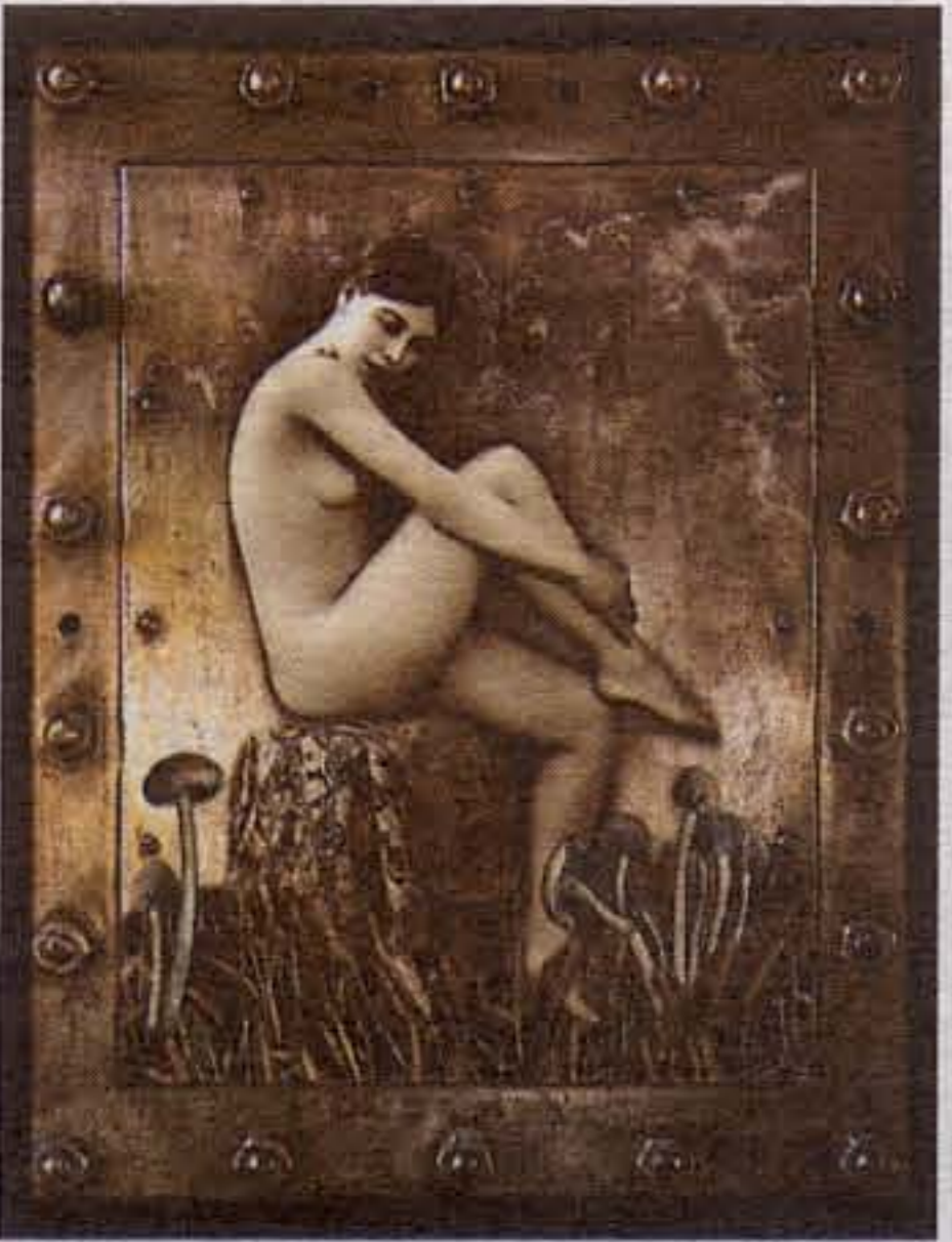
FIRST LIGHT, A DIGITAL COLLAGE, $69-149 (FINE ART PAPER), $95-$245 (GICLEE CANVAS) FROM LAST METRO.