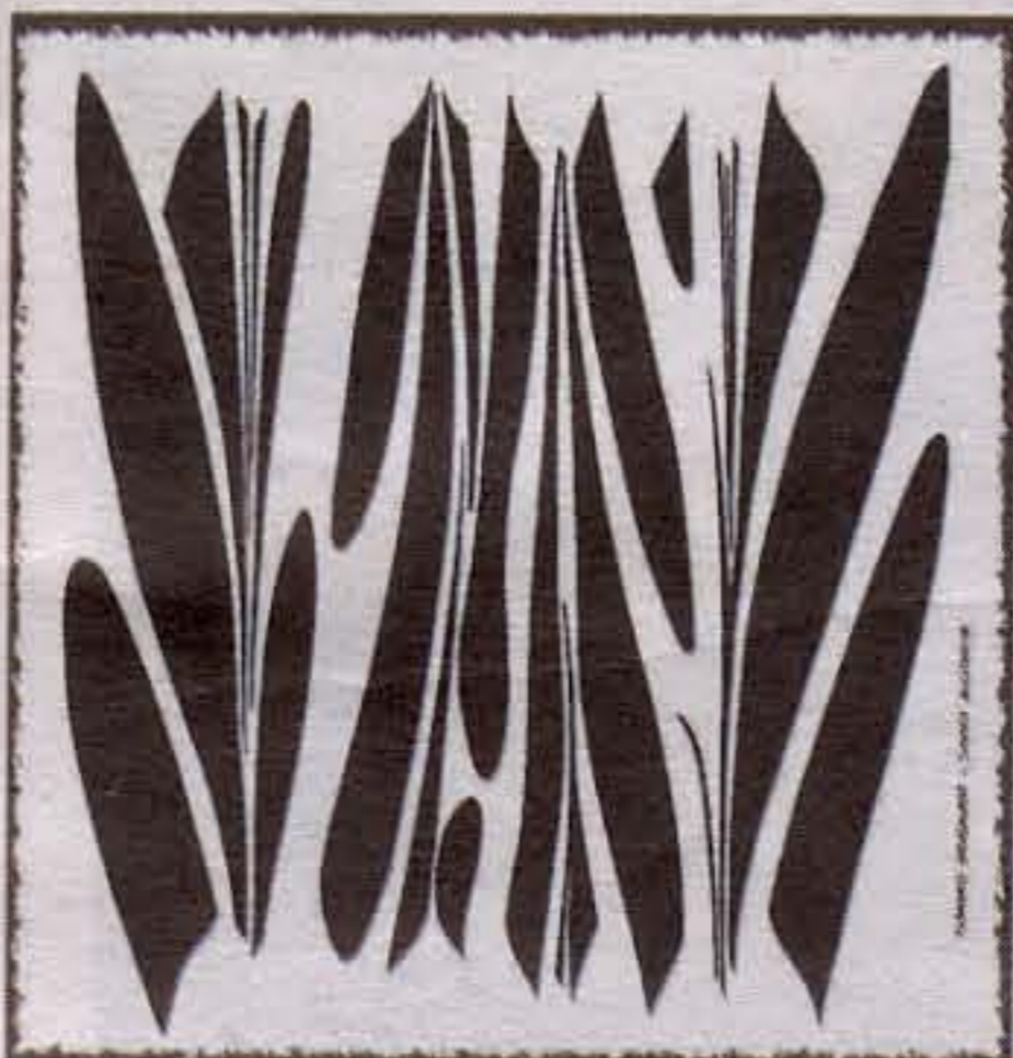
ABSTRACT FLORENCE BROADHURST LIMITED EDITION, $690 UNFRAMED, $1135 FRAMED FROM SIGNATURE PRINTS.

Fabric panels look great and can also improve the acoustics in a room. Acoustic Art is a new company that combines form and function with a range of digital artworks on fabric that are bonded to high-density acoustic foam to reduce extraneous noise.