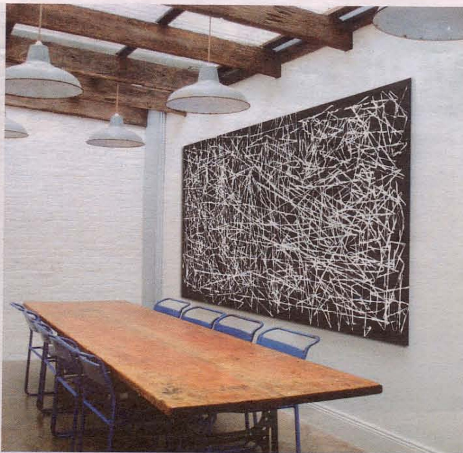
EXCITE, A LARGE FABRIC PANEL THAT BUFFERS SOUND IN ANY ROOM. $1100 FROM ACOUSTIC ART.