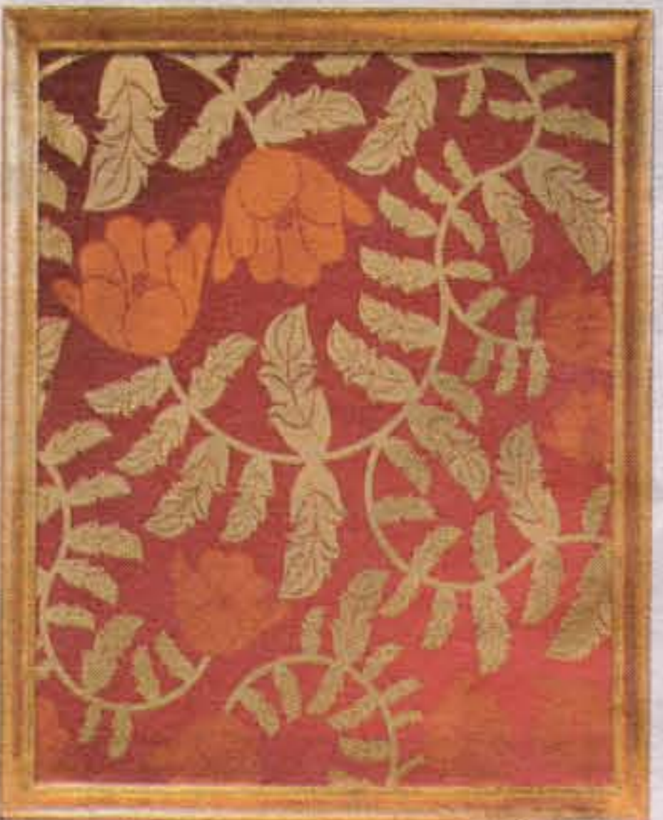
POPPY TWO-COLOUR WALLPAPER ON CATALAN RED BASE, $66 PER METRE FROM AFFICIONADOS OF THE NOD.