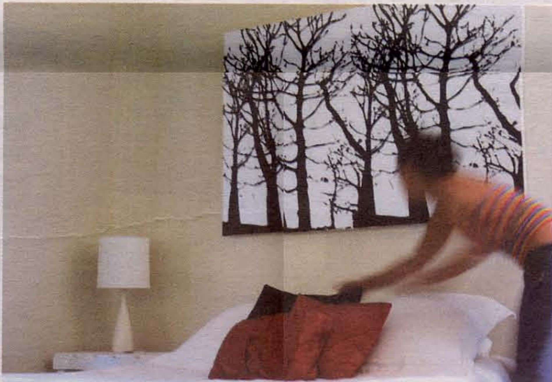
HILLSIDE, A PHOTOGRAPH HAND-SCREEN-PRINTED ONTO COTTON DRILL, $841 FROM SALU.